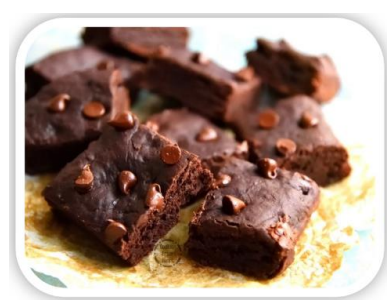
BANANA BREAD MIXED VEGE BITES AVOCADO BROWNIE FLAT BREAD ORANGE FIZZ VEGE BOLOGNAISE

The links to the recipes that the children made on Wednesday are below.